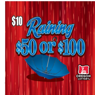
$10 | Raining $50 or $100