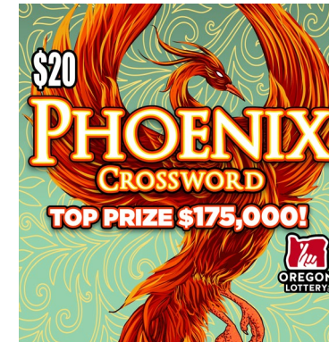
$20 | Phoenix Crossword