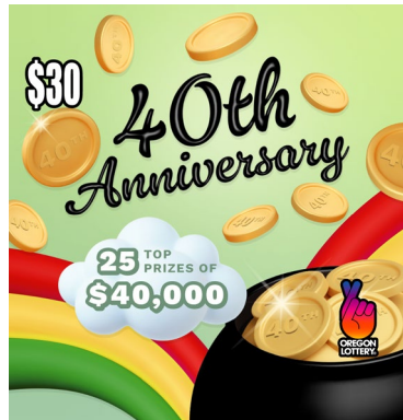
$30 | 40 th Anniversary