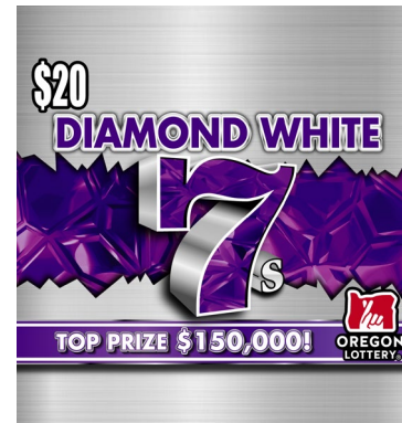
$20 | Diamond White 7s